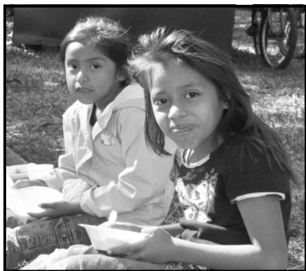
School Children on summer recess