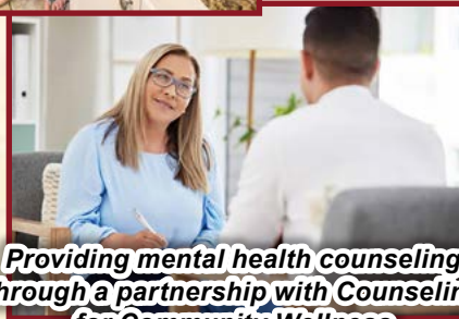
Providing mental health counseling through a partnership with Counseling for Community Wellness