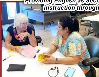
Providing English as Second Language one-on-one tutoring and classroom instruction through partnership with Yesukan Adult Education