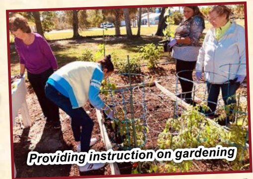
Providing instruction on gardening