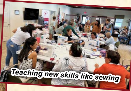
Teaching new skills like sewing