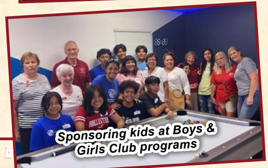
Sponsoring kids at Boys & Girls Club programs