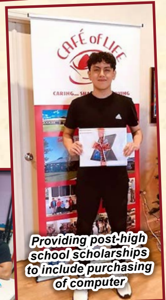
Providing post-high school scholarships to include purchasing of computer