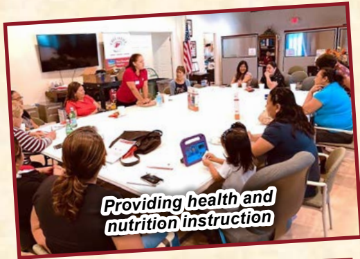
Providing health and nutrition instruction