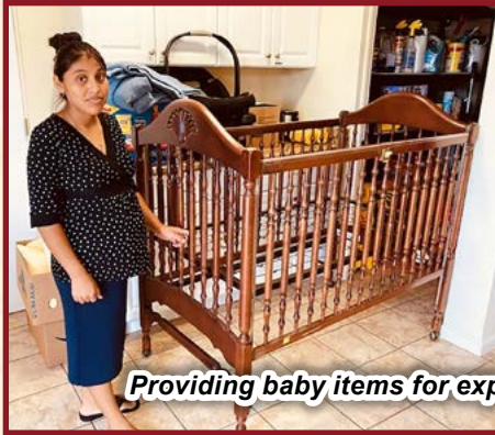
Providing baby items for expecting mothers