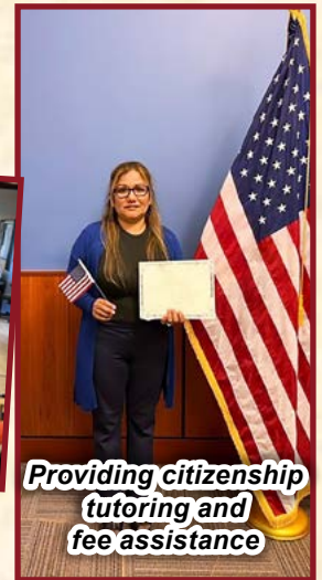
Providing citizenship tutoring and fee assistance