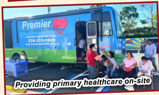
Providing primary healthcare on-site