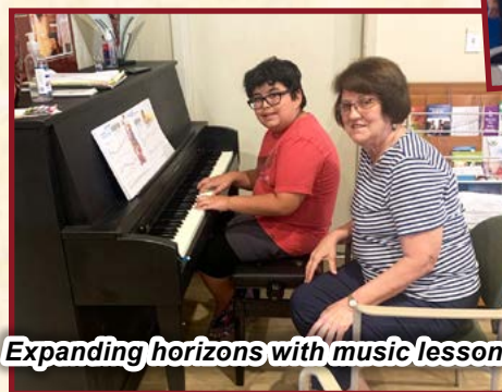
Expanding horizons with music lessons