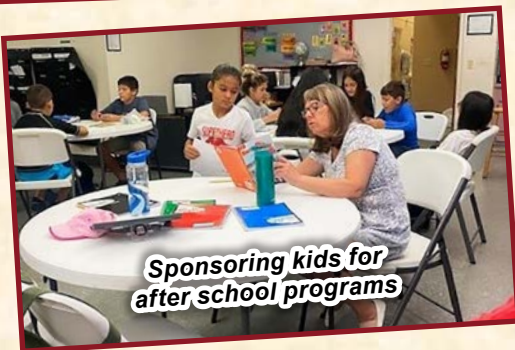
Sponsoring kids for after school programs